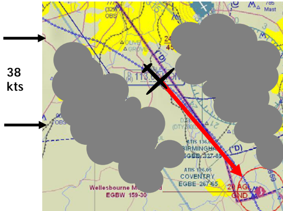
Notice how as the clouds + gap moved from left to right, our concentration on aiming for a fixed ground reference in the distance caused us inadvertently to drift to the right