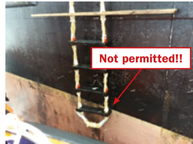
1 – Dangerous loop at bottom of ladder