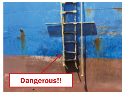
2 – Uneven ladder step