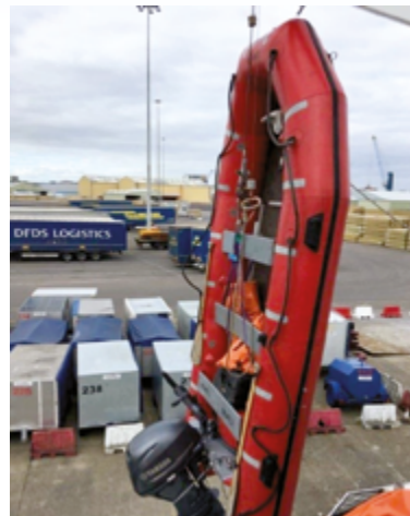
Rescue boat – hanging vertically because strops have not been fitted correctly

The lifting strops for the vessel's two inflatable rescue boats, (IRB's), had recently been renewed. At the time of the incident the vessel was alongside, and the opportunity was taken for some familiarisation training. This included swinging out the port rescue boat. Unfortunately, the deck crew who had fitted the new strops attached the aft strops to strongpoints on the hull, and not to the correct lifting points on the transom. This resulted in an unstable lift as the weight of the outboard motor caused the boat to rotate about the aft strops and assume a vertical position, bow up, as shown in the photograph.