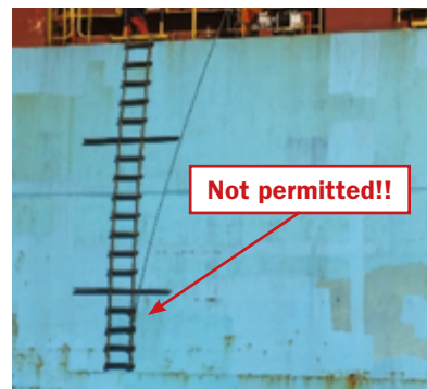
3 – Tripping line below spreader