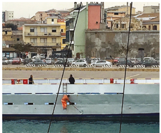
Painting over the side – lack of safety precautions

The following is a brief description of a scene that I witnessed whilst alongside in a small Mediterranean port. There was a small coastal ferry moored directly astern of us which is used to connect the port with a nearby island. On her starboard (outboard) side, I could clearly see a crew member working over the side in an unsafe manner. He was dangerously leaning over a metal embarkation ladder and was not wearing any kind of personal protective equipment apart from safety shoes. This picture was taken at the time. There was also what looked like an officer supervising the job from the deck... demonstrating a complete lack of safety culture!