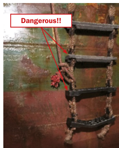
4 – Bent step and tripping line below spreader